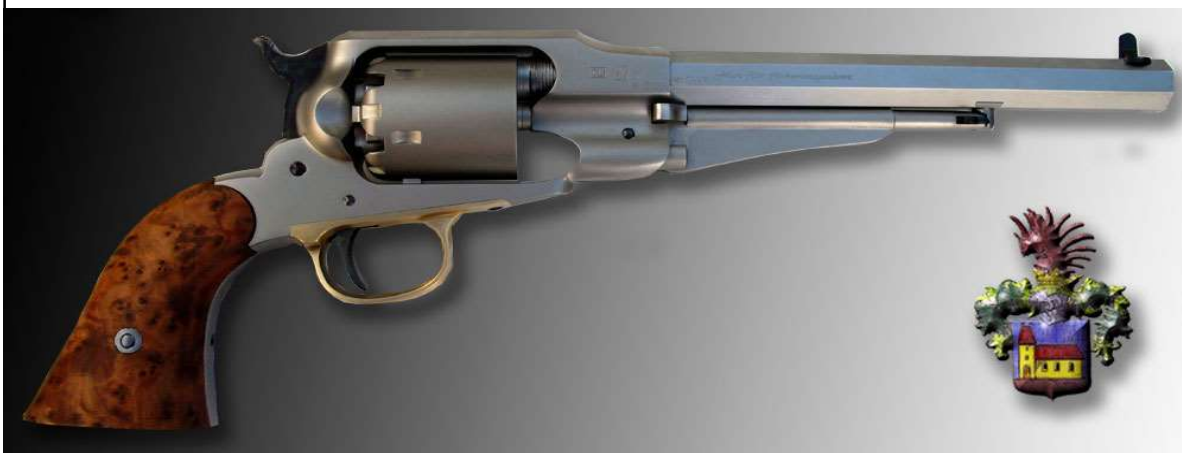
Baumkircher Remington revolver repro