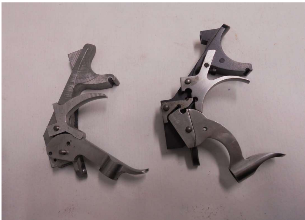
Trigger system History versus contemporary type